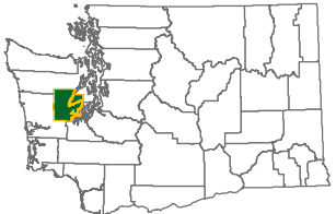
Mason County, WA Locator Map